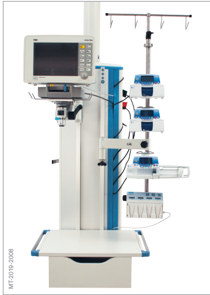
Movita with cable management system